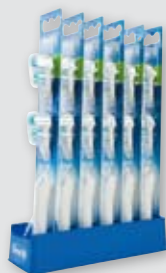
Blister in plastic tray