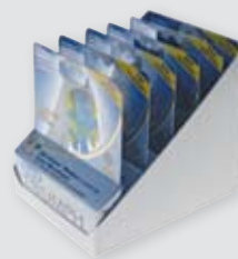
Fifth panel cartons in chipboard display tray