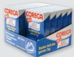
Cartons in display tray