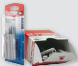
Blister pack and re-closable carton