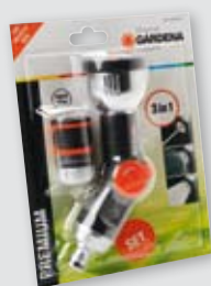
Face seal blister pack